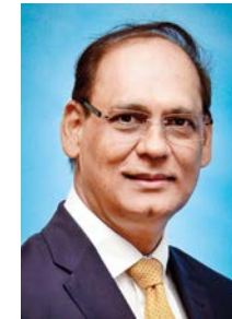
Mahen Kumar Seeruttun Minister of Financial Services and Good Governance