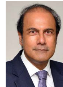
Louis Steven Obeegadoo Deputy Prime Minister and Minister of Tourism, Housing and Land Use Planning

Economic diversity, alongside astute policymaking and governance, brings resilience in the face of global challenges: the nation's GDP expanded by 4 percent in 2021 and is expected to grow by over 6 percent this year. Those factors have also encouraged one of the highest foreign investment rates in Africa. According to Mahen Kumar Seeruttun, Minister of Financial Services and Good Governance: “The World Bank's 2020 Ease of Doing Business Report ranks Mauritius 13th in the world and first in Africa. It's the perfect base for facilitating investments into the region. For example, access to the African market is seamless due to our membership of various trade blocs,