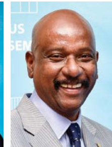
Georges Pierre Lesjongard Minister of Energy and Public Utilities