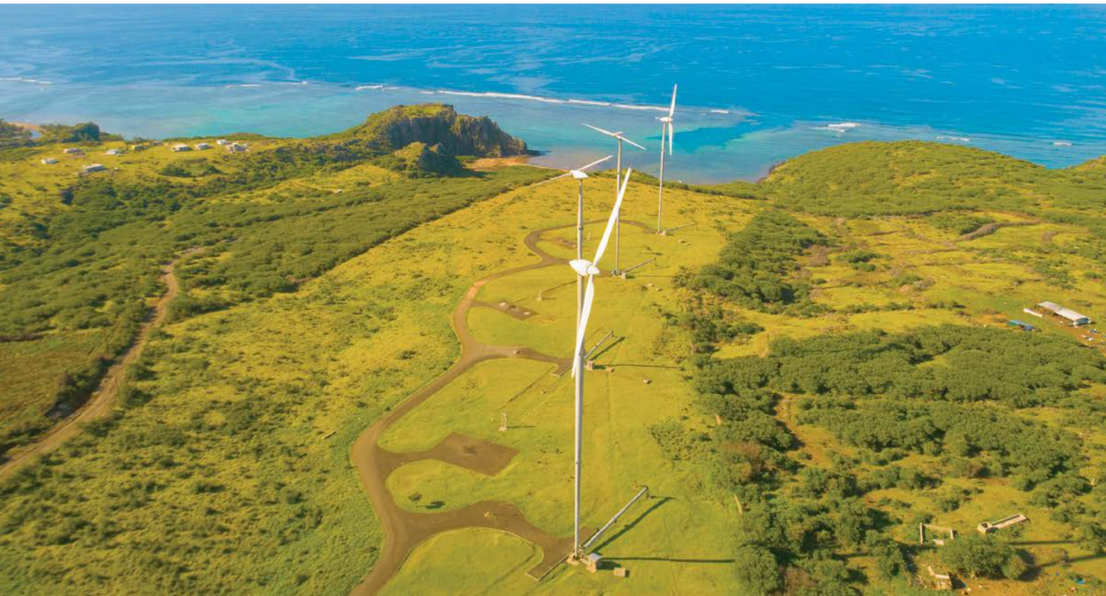
Grenade Wind Farm, Rodrigues

“Tapping into our renewable energy potential”