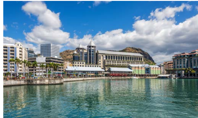
Port Louis combines history with modern architecture