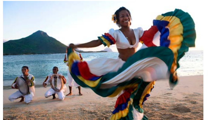
Sega music is a vital element of Mauritius' heritage

Many of those tourists will have chosen Mauritius for its glorious white beaches, sparkling blue lagoons and year-round balmy climate, says Obeegadoo: "That's been the traditional sand, sea and sun hallmark of our tourism and, on that score, we match any destination in the Indian Ocean area. However, Mauritius has much more to offer. For instance, it has a rich history, as people have settled here from all around the world over the centuries, and we have evolved our own culture, cuisine, clothing, music and languages." The unique diversity of its heritage and culture can be experienced throughout