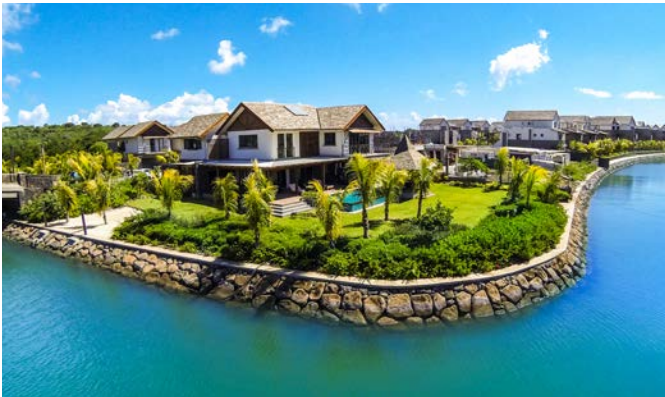
Mauritius offers a wide range of excellent property options

Increasingly, investors, entrepreneurs, professionals and retirees from around the world are relocating to Mauritius