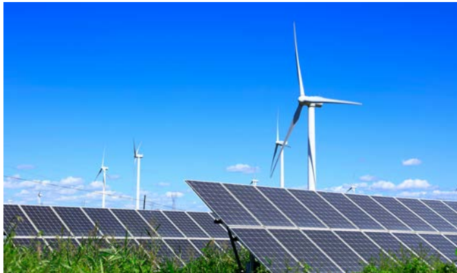
Mauritius is in a privileged position for solar and wind power