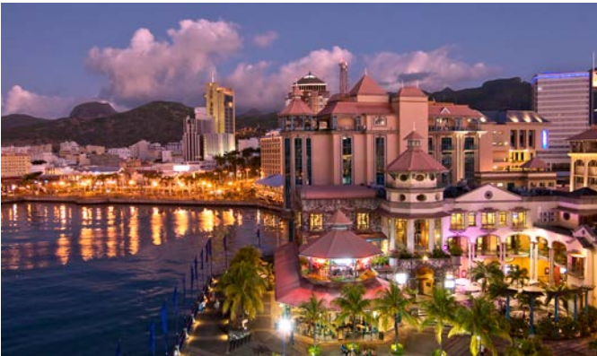
The country is home to a highly experienced financial center

The country has proved itself as a tried-and-tested, compliant and innovative hub for international financial services