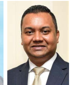
Deepak Balgobin Minister of Information Technology, Communication and Innovation

and we have free trade agreements with China and India, making us an excellent bridge between Asia and Africa. In addition, our banking system is solid and we have a robust, dynamic international financial center that adheres to international standards and contributes around 13 percent of our GDP.”